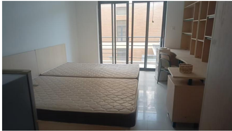
double room in Fengxian Campus