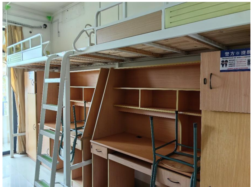
quad room in Fengxian Campus