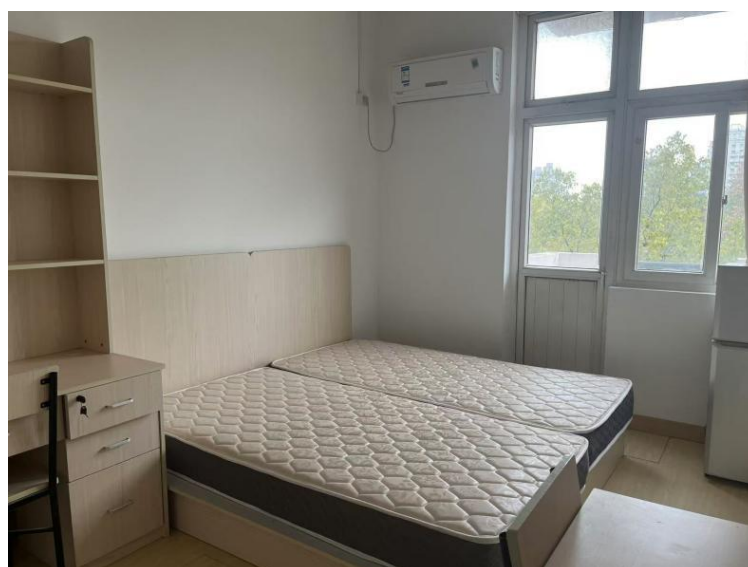
double room in Xuhui Campus